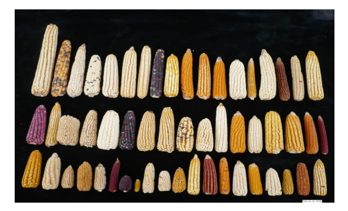
Maize ears

and efficiency are not enough to meet the global needs of protein, which requires agricultural scientists to innovate a new way to produce the proteins independent of the existing farmland. We proposed de novo domestication of "novel crop" to meet the future personalized demands. Human-guided domestication began approximately 12,000 years ago. Only around 100 species out of 400,000 plant species had been domesticated as modern crops. Nowadays, just 15 crop species provide 70% of the world's food energy intake, among which corn, rice, and wheat make up as much as 50%. The continuously growing global population and the drastic consuming revolution have triggered more and more pressure on traditional agricultural production and serious food demands by re-domesticate some new crops from wild or semi-domesticated plants satisfying humans' emerging needs of nutrition, quality, and production? I and Professor Alisdair R. Fernie from the Max Planck Institute of Molecular Plant Physiology wrote a perspective paper in Molecular Plant to discuss it. We believe that recent developments in genome editing allow rapid and precise "de novo domestication".